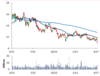
Calpine (CPN) - $10.08