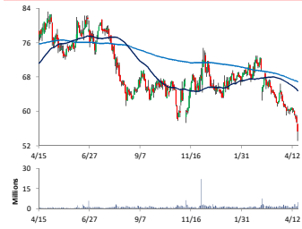
Envision Healthcare (EVHC) - $55.36