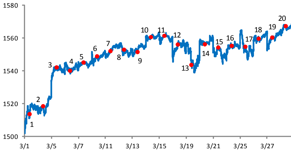
S&P 500 Intraday: March 2013

With the month of March behind us, we put together a refresher of some of the more notable market events that occurred during the month using Bloomberg and other headlines. Below we provide an intraday chart of the S&P 500, highlighting significant events as they occurred. On pages two and three we provide an annotated daily chart showing notable WSJ headlines from the last seven months.